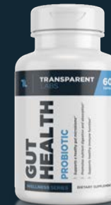
GUT HEALTH SERIES